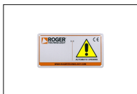
R99/C/001 Signboard "Automatic Opening".